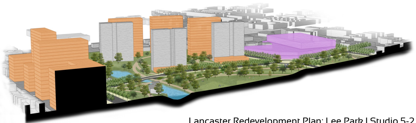
Lancaster Redevelopment Plan: Lee Park | Studio 5-2