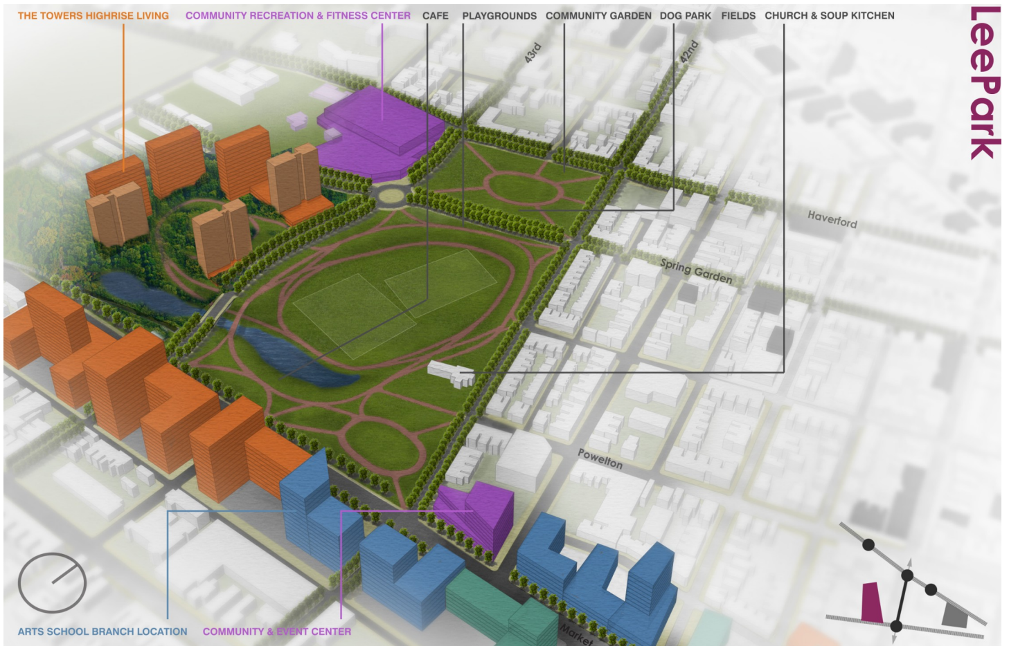
Lancaster Redevelopment Plan: Lee Park | Studio 5-2